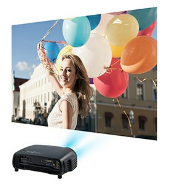
Conventional projectors offer low-quality images