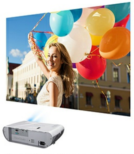
SuperColor™ projectors offer color accuracy levels

ViewSonic's exclusive SuperColor™ Technology offers a wider colour range than conventional projectors for true-to-life color performance in any light. SuperColor™ 6-Segment Color Wheel maximizes brightness with the highest colour saturation over others in the same class.